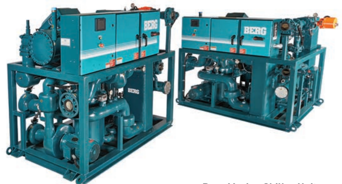
Berg Marine Chiller Units

From our Toronto-based, ISO 9001 certified facility, we custom design, manufacture, test and integrate a wide range of skid mounted and factory tested industrial process refrigeration equipment, mechanical packages and fluid pumping systems that precisely meets all functional and economic requirements and challenges.