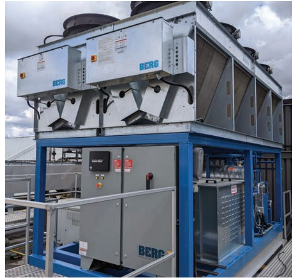
Outdoor Air-Cooled Chiller