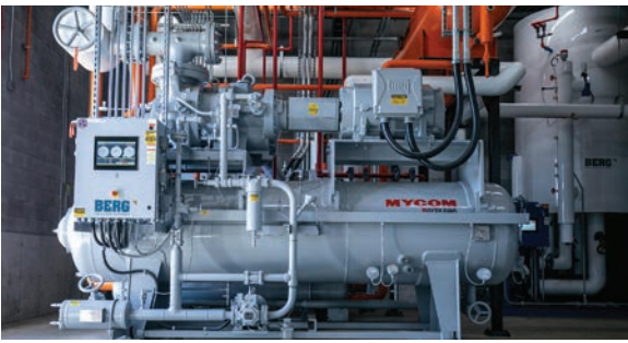
Ammonia Indoor Refrigeration System