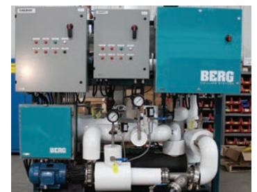
Temperature Control Unit for Syltherm Fluid (-29C to 200C)