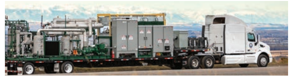
Refrigeration System for Oil & Gas Applications