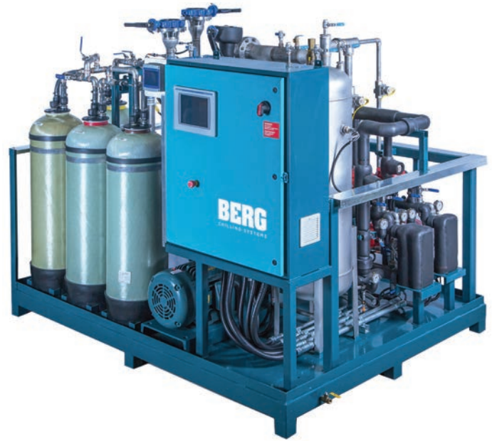
Temperature Control Unit

Adding or removing refrigeration circuits used for standby or load balancing, or stretching or shrinking a pump tank package to meet a dimensional constraint can be easily managed using our proprietary in-house design tools. The result is always the right solution within budget.