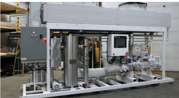
Ammonia Outdoor Chiller