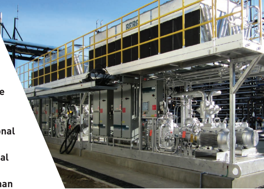
Outdoor air-cooled chilling system for a polyethylene production facility

For over 50 years, Berg has built an international reputation for designing, manufacturing installing, and servicing thousands of industrial thermal process control and industrial refrigeration systems to customers in more than 50 countries worldwide in multiple industries.