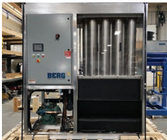
Shell Ice Maker