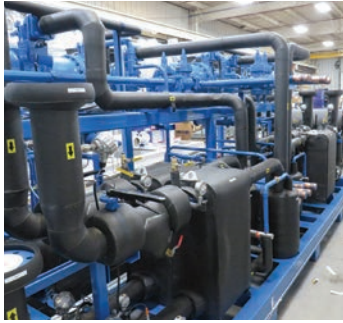
4-circuit Air-cooled Indoor Chiller