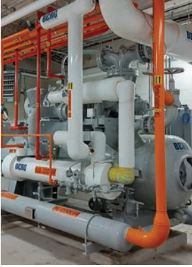
Ammonia Glycol System