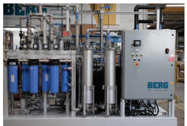
Water Filtration Unit