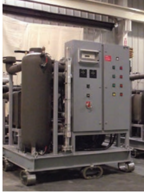
Military Vessel Electronics Cooling