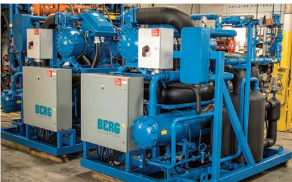
Ice Rink Chiller