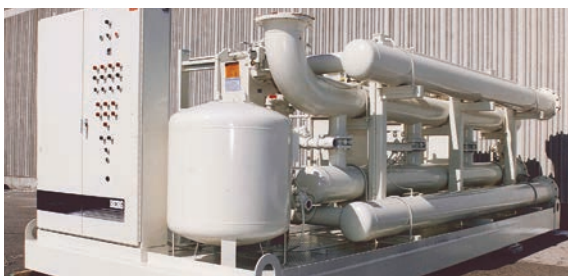
Closed Pumping System