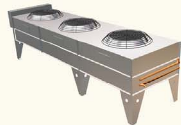
Outdoor Remote Condenser

Receiver (Allows start-up and operation during low ambient temperature)