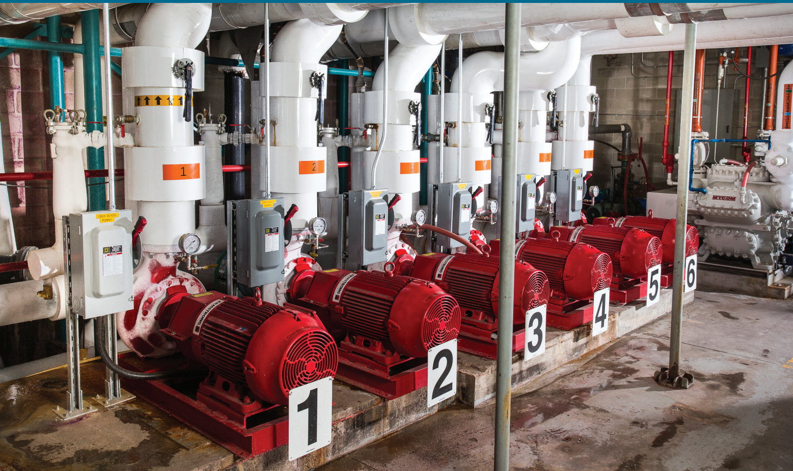
Max efficiency and control - glycol pumps with variable frequency drives each feed a specific rink